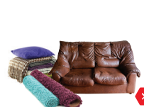
NO Clothing, Furniture & Carpet NO ropa, muebles y alfombras