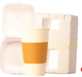
NO Foam Cups & Containers NO vasos y recipientes de poliestireno