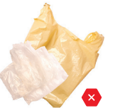
NO Loose Plastic Bags, Bagged Recyclables or Film Empty recyclables directly into your cart NO bolsas y envolturas de plástico sueltas, o materiales reciclables embolsados. Vacíe directamente los materiales reciclables en nuestro carrito