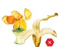
NO Food or Liquids NO comida o líquidos

No Incluir En Su Contenedor De Reciclaje