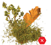
NO Green Waste NO desechos verdes