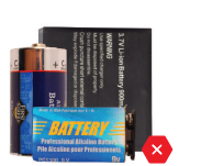
NO Batteries Check local drop-off programs for proper disposal NO baterías - Verifique los programas locales de entrega para su correcta eliminación