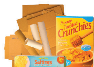
Flattened Cardboard & Paperboard Cartón y cartulina aplastados