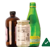
Glass Bottles & Containers Botellas y envases de vidrio