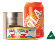
Food & Beverage Cans Latas de alimentos y bebidas