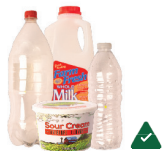
Plastic Bottles & Containers Botellas y envases de plástico